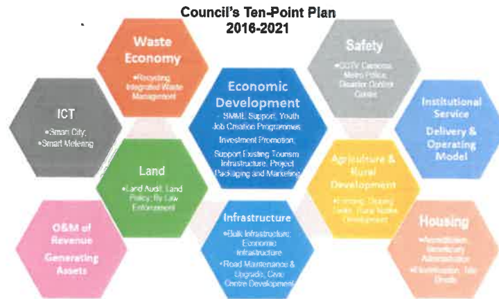
Figure 1: Council's Ten-Point Plan

were endorsed. At a Councillors' Workshop held over two days (15 and 19 March 2019) further amendments were considered and approved impacting on the broad strategic framework of the municipality.